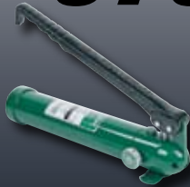
767 Hydraulic Hand Pump