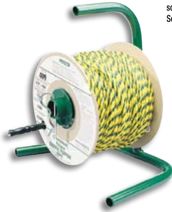
405 Rope Stand sold separately. See page 156.